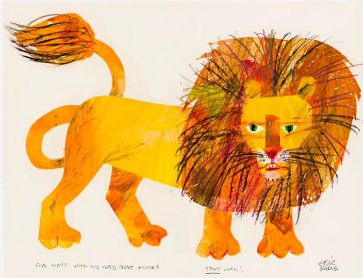
“That Lion!” by Eric Carle