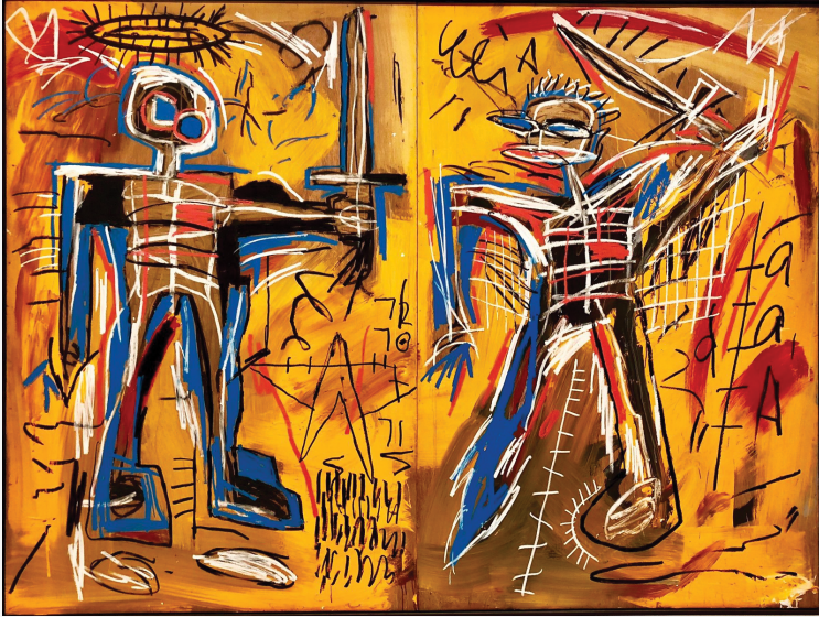
Defensive Orange / Offensive orange by Jean-Michel Basquiat