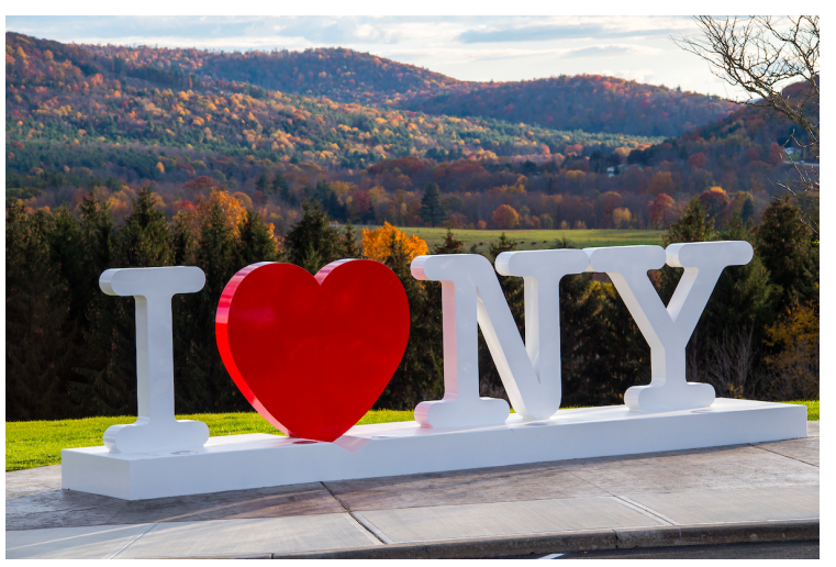
I love NY ad campaign by Milton Glasier