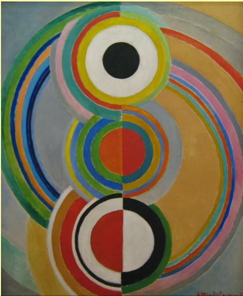
Rythme , 1938, oil on canvas, 182 x 149 cm, Musée National d'Art Moderne, Centre Pompidou, Paris