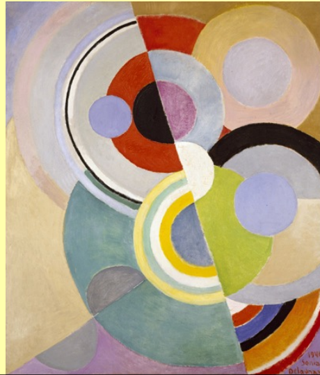
Rythme Coloré (Colored Rhythm) , 1946, in "Color Moves: The Art and Fashion of Sonia Delaunay," 2011, at the Cooper-Hewitt, National Design Museum