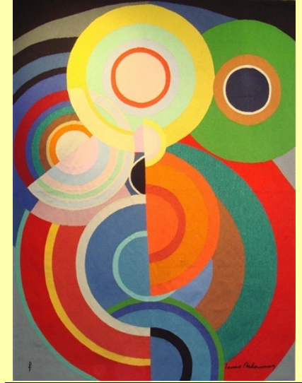
Petite automne , Aubusson tapestry, 67 x 49.5 in. (170.2 x 125.7 cm.)