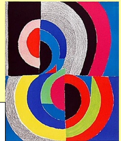
Plougastel , ca. 1970, Prints and Multiples, Lithograph in colours, Edition of 75, 50 x 61 cm - Sheet: 76 x 56 cm