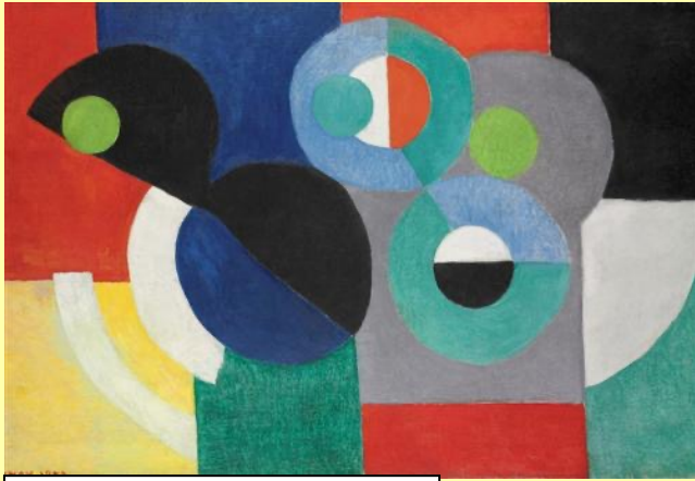
Rythme Colore, 1952