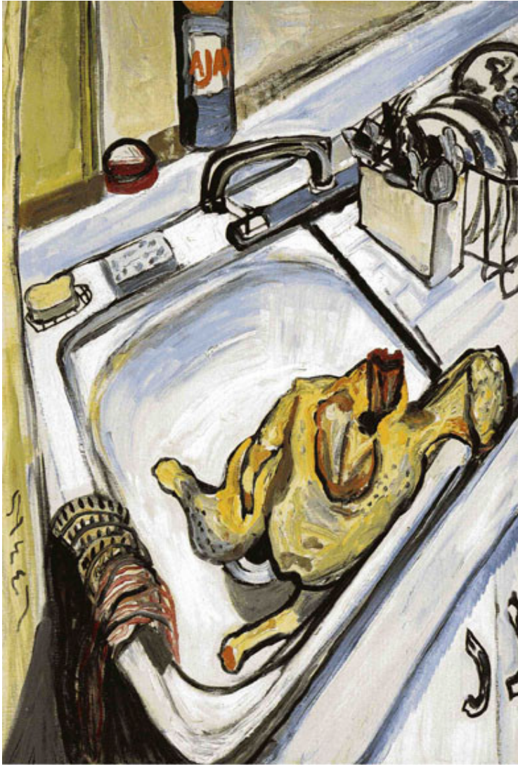
Thanksgiving by Alice Neel