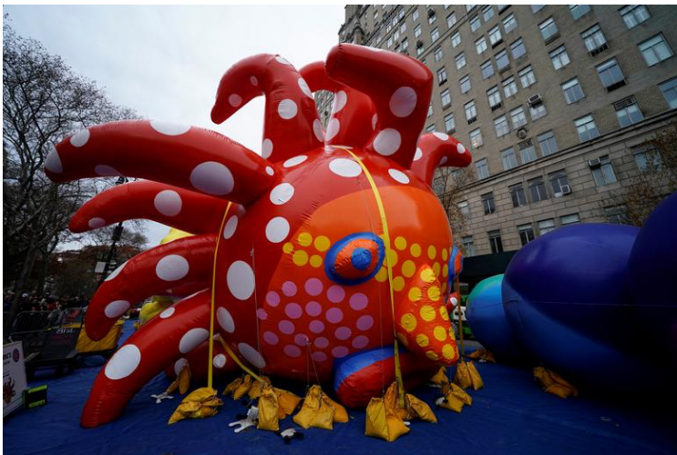
Love Flies Up to the Sky by Yayoi Kusama