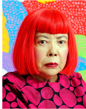
Yayoi Kusama 1929-

Yayoi Kusama is a Japanese contemporary artist best known for her sculpture and installations. Kusama's work also includes painting, performance, film, fashion, poetry, fiction, and more. She has been called 'the princess of polka dots' because it is the common theme in her work. Her repetitive dots and marks allows her to feel as if everything is melting and melding into the bigger universe.