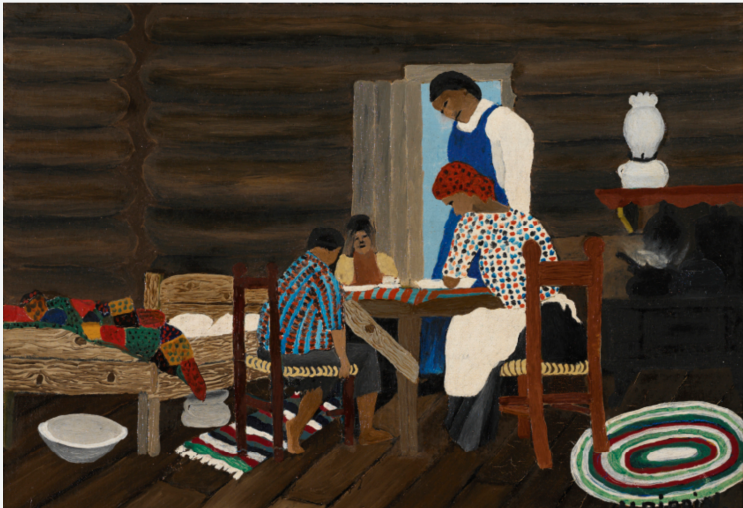
Giving Thanks by Horace Pippin